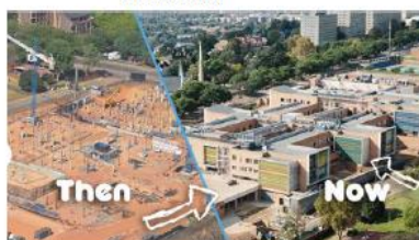
Nelson Mandela Children's Hospital